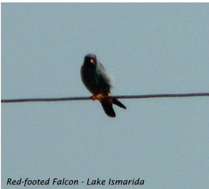
Red-footed Falcon - Lake Ismarida

The lake was teeming with marsh terns, Black, White-winged and Whiskered . A Bittern flew across the reeds. A perched raptor resolved itself into a White-tailed Eagle , with its mate then seen circling above. The nest, with two almost fledged eaglets was nearby. We carried on towards the sea, checking the fields for Calandra Lark, but with no luck on this occasion. Returning, we took the track on the eastern side. Here we had a male Red-footed Falcon on the wires.