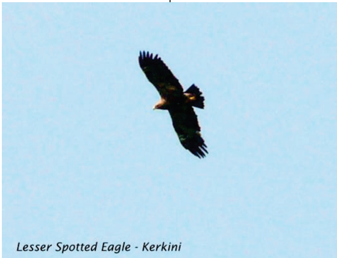
Lesser Spotted Eagle - Kerkini