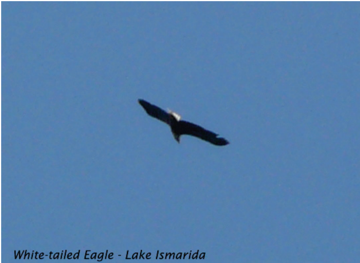
White-tailed Eagle - Lake Ismarida