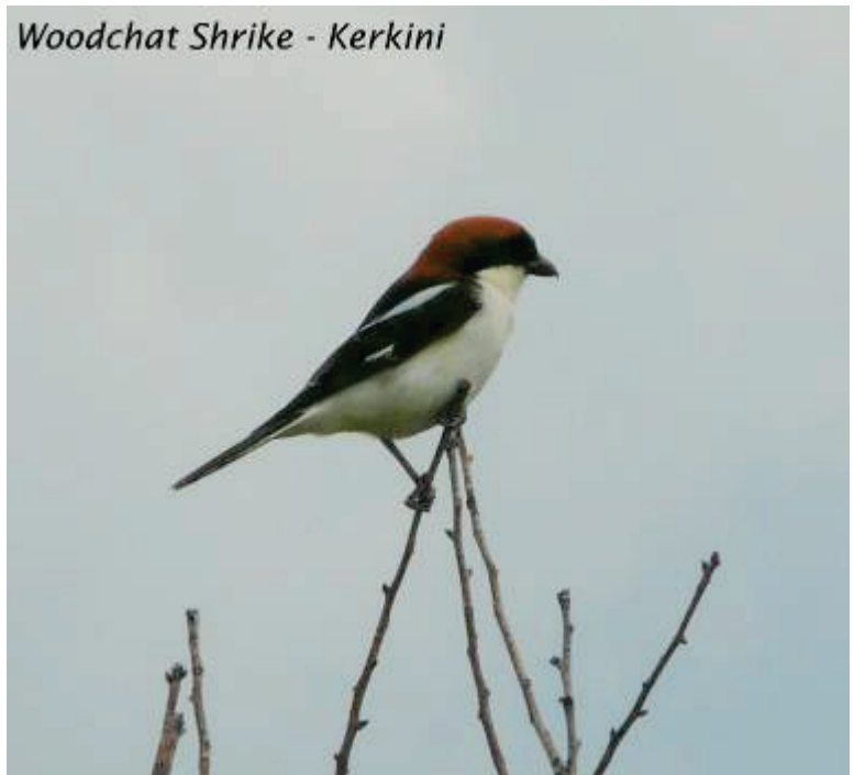
Woodchat Shrike - Kerkini

The lake was teeming with marsh terns, Black, White-winged and Whiskered . A Bittern flew across the reeds. A perched raptor resolved itself into a White-tailed Eagle , with its mate then seen circling above. The nest, with two almost fledged eaglets was nearby. We carried on towards the sea, checking the fields for Calandra Lark, but with no luck on this occasion. Returning, we took the track on the eastern side. Here we had a male Red-footed Falcon on the wires.